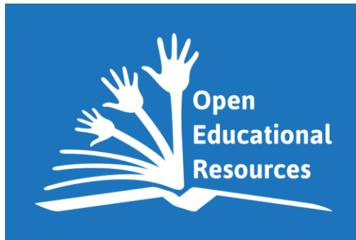
Figure 1: Global Open Educational Resources Logo xii

[...]The recommended definition of Open Educational Resources is: The open provision of educational resources, enabled by information and communication technologies, for consultation, use and adaptation by a community of users for non-commercial purposes. (UNESCO, 2002, p. 24)